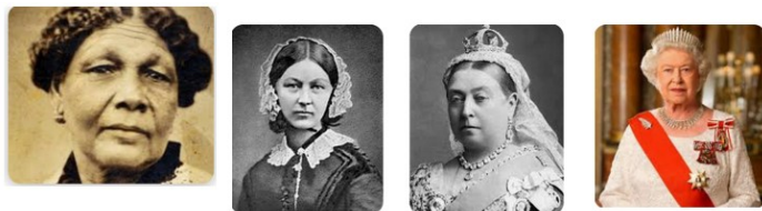
Significant women time periods